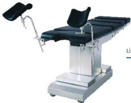
Lithotomy position for gynecology & urology