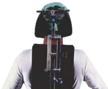
Shoulder Surgery Attachment