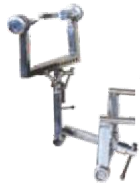
mayfield head clamp