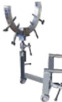
sugita head clamp