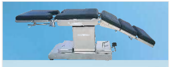
Back plate down