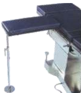
Translucent hand rest with adjustable support