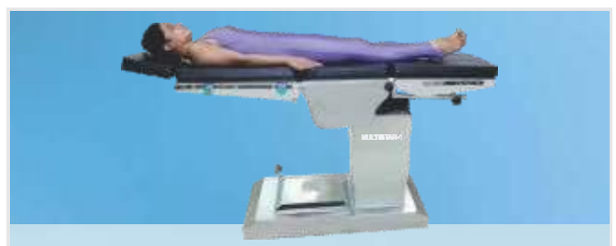
Longitudinal shift towards Head end