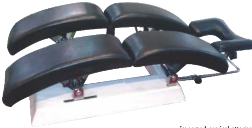
Imported cervical attachment