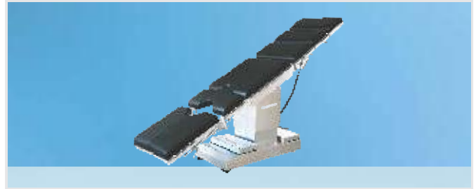
Reverse Trendelenburg position