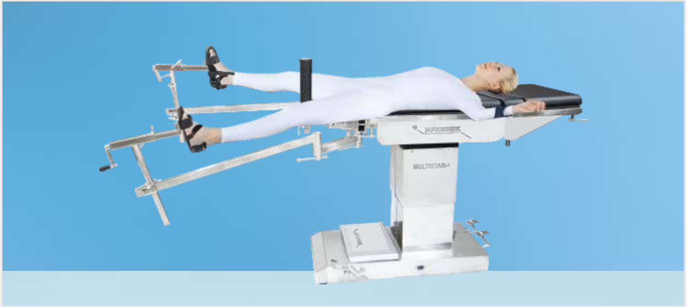
Orthotec-2 Radiolucent pelvisplate orthopedic extension