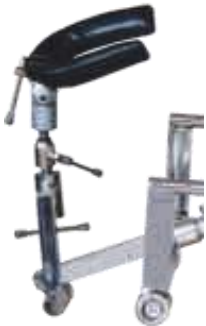
Horse shoe attachment