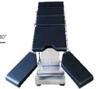
Split leg section up & down split 180°