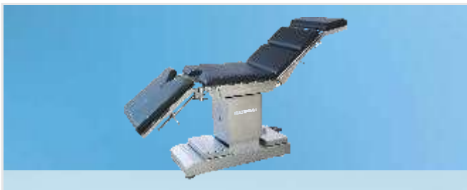
Back plate up