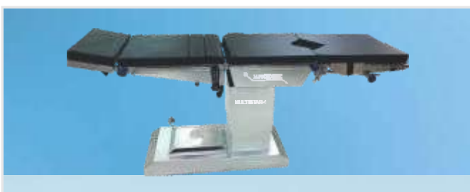
Longitudinal shift towards leg end