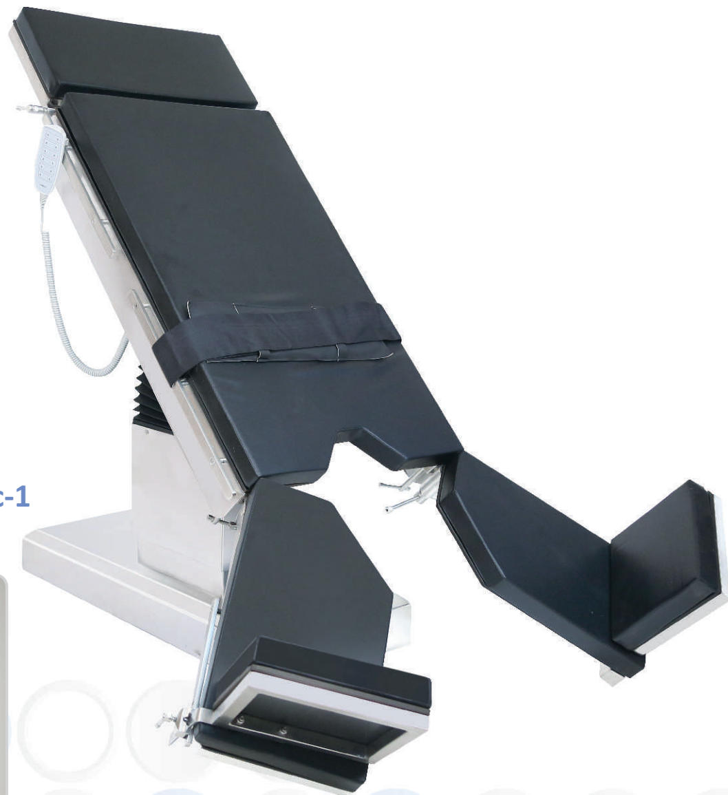
Model : Bariatric-1