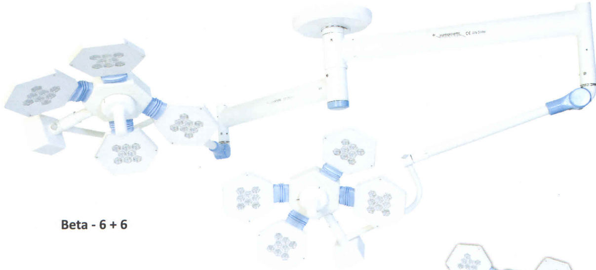
Beta - 6 + 6